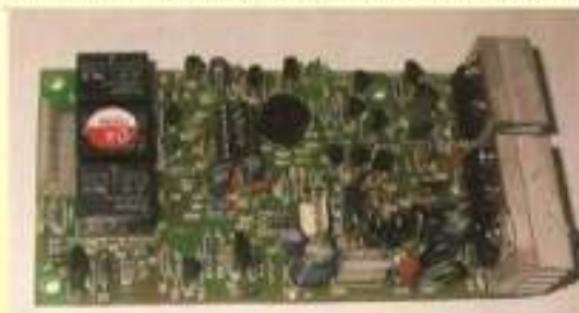
12 V 600 VA

We are pleased to introduce ourselves as India's Premier designer and manufacturer of high quality power conditioning equipment of International Standards for the last 13 years.