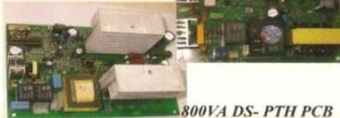
800VA DS- PTH PCB